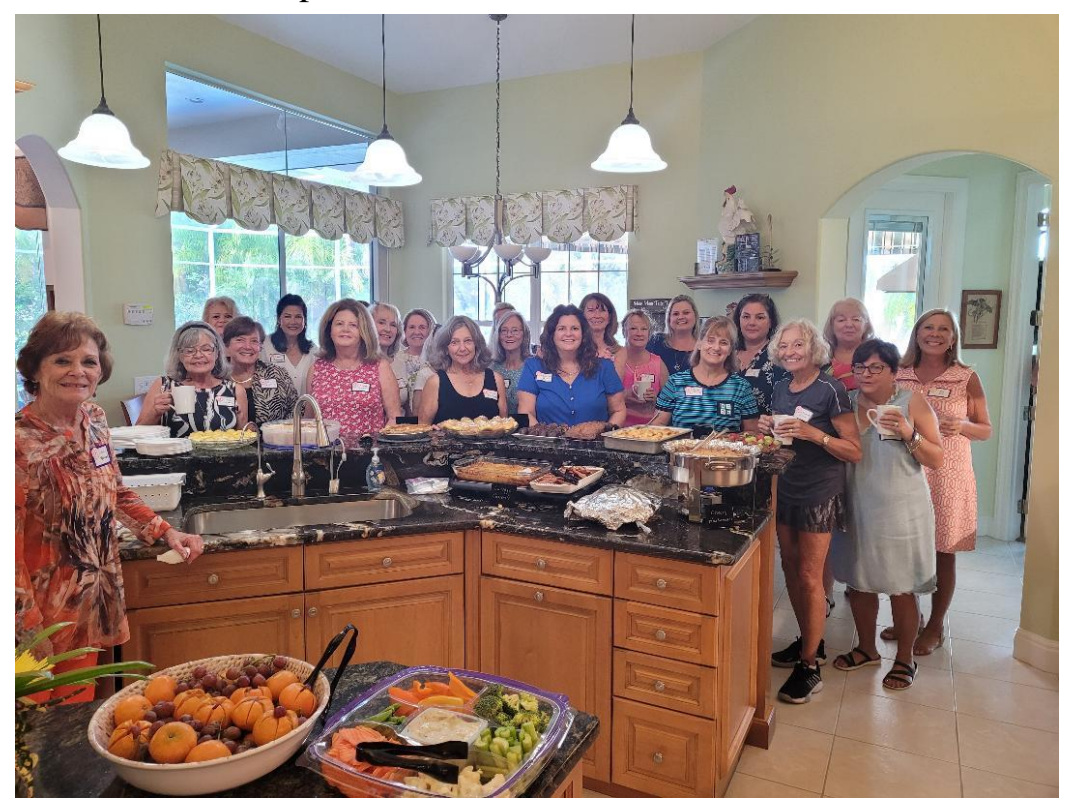
Ladies Coffee – September 24, 2022